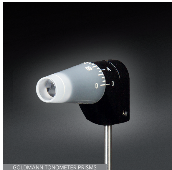
GOLDMANN TONOMETER PRISMS